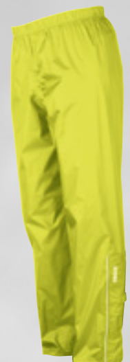
Neon Gelb 7789 - 0880 (only 7789 in S. XS - 4XL)