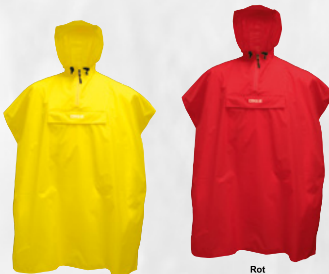
Gelb 3050 - 0906