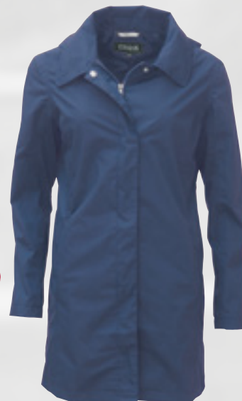
Vintage Indigo 8835 - 0953