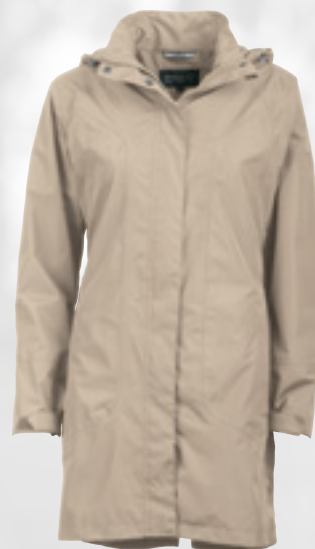
Greige 5651 - 0891