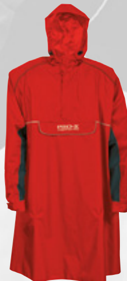
Rubinrot - Anthrazit 3090 - 0020