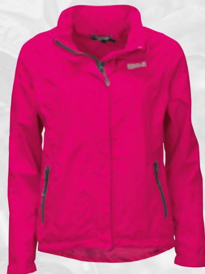
Cherry 7590 - 0833