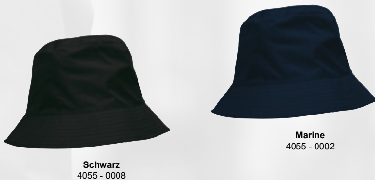
Schwarz 4055 - 0008

Head circumference: M=56 cm, L=58 cm, XL=61 cm