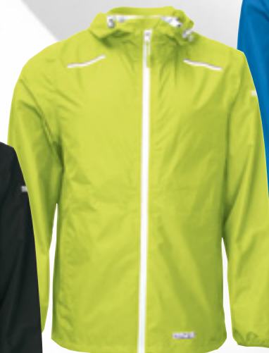
Neon Gelb 7770 - 0880