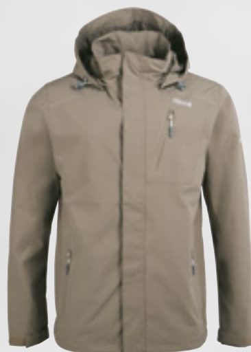
Greige 2470 - 0891