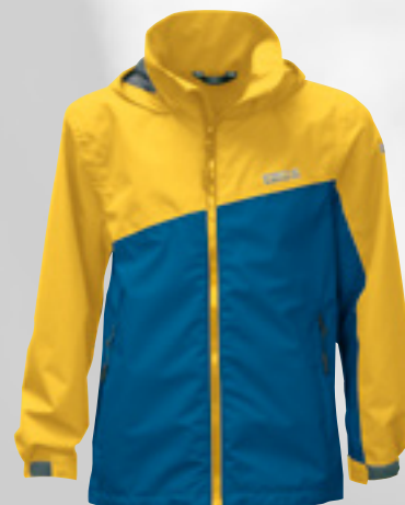
Solar - Blue Saphir