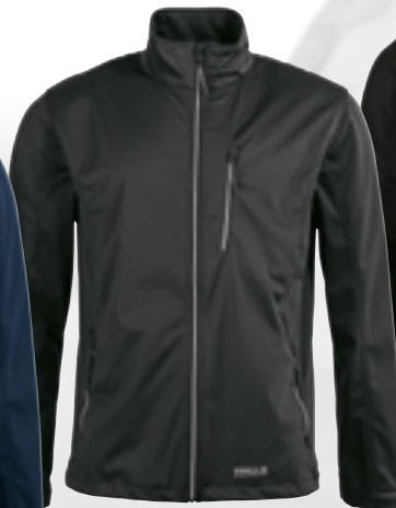
Anthrazit 2720 - 0922