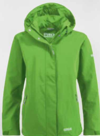
Kiwi 3477 - 0846