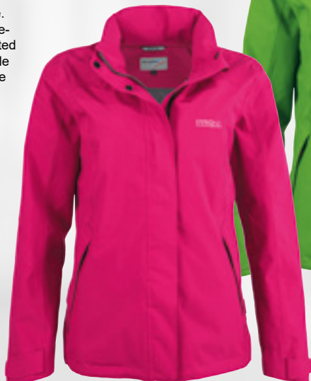
Cherry 5225 - 0833