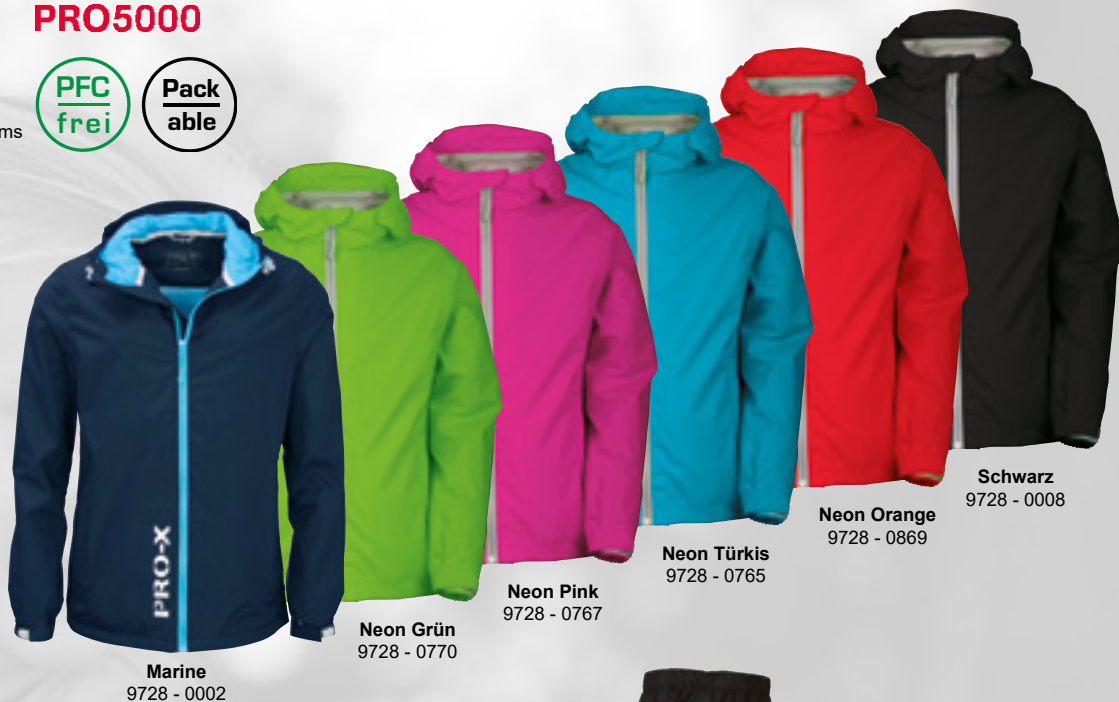
Marine 9728 - 0002