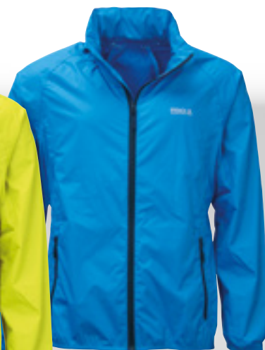
Brilliant Blue 7020 - 0773