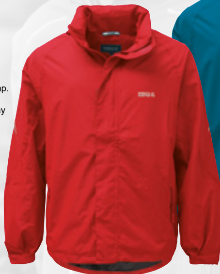
Rubinrot 7520 - 0020