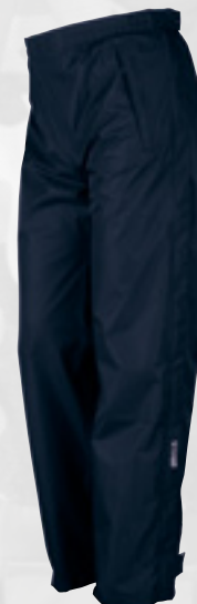
Marine 0002 (nur 4022)