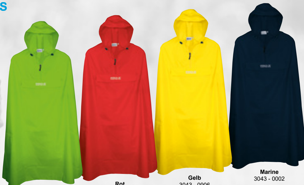
Neon Grün 3043 - 0770