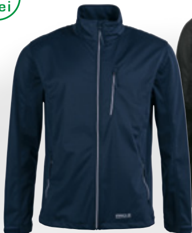
Marine 2720 - 0002