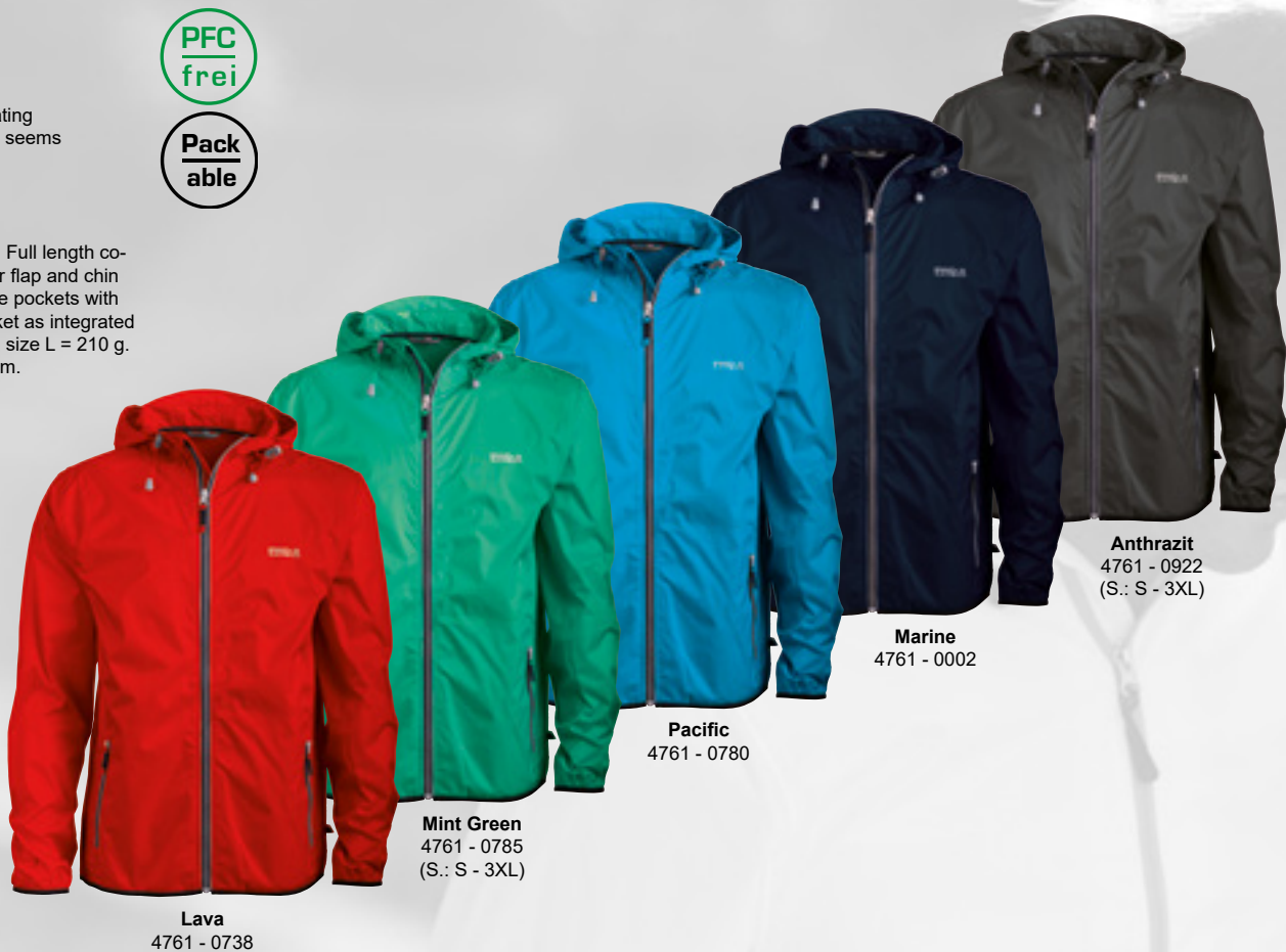
Lava 4761 - 0738