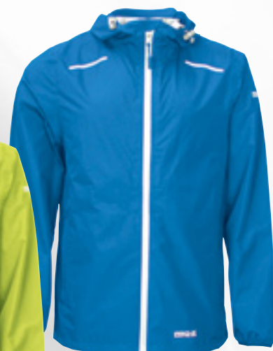
Brilliant Blue 7770 - 0773