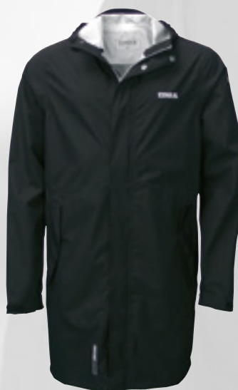
Schwarz 4741 - 0008