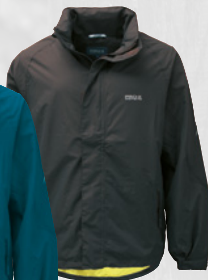
Anthrazit 7520 - 0922