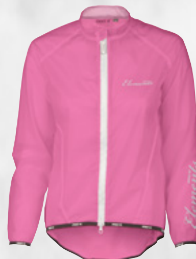
Neon Pink 6635 - 0767