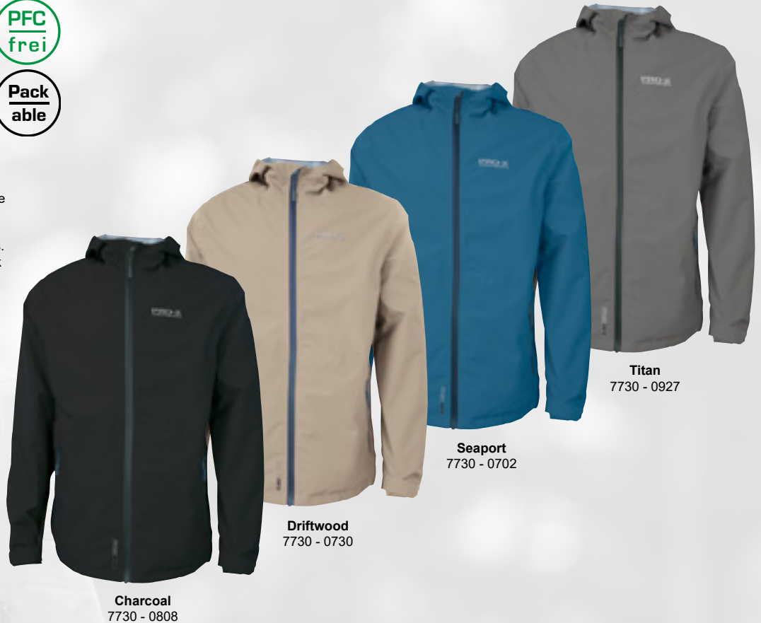
Charcoal 7730 - 0808