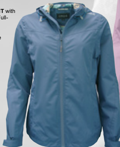
Vintage Indigo 5735 - 0953