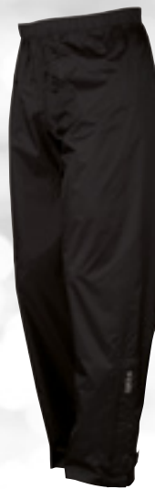
Schwarz 7078 - 0008