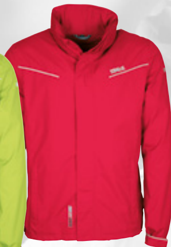
Mars Red 7840 - 0873