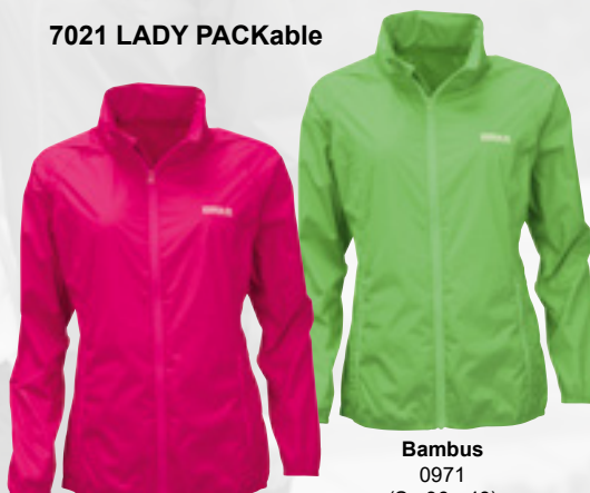
Cherry 0833 (S.: 36 - 48)