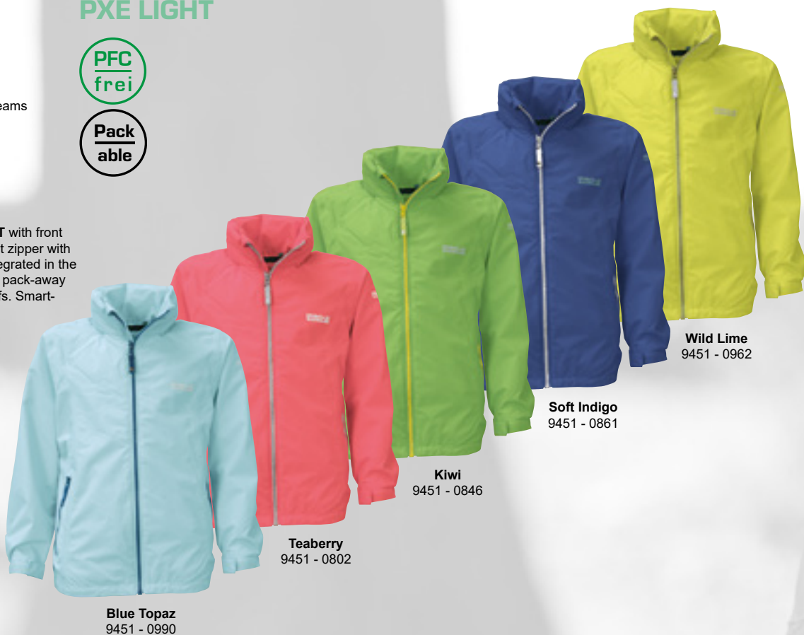
Blue Topaz 9451 - 0990