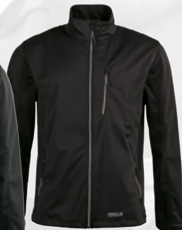
Schwarz 2720 - 0008