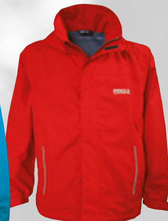
Lava 9920 - 0738