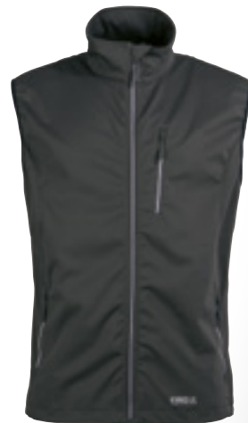
Anthrazit 2722 - 0922