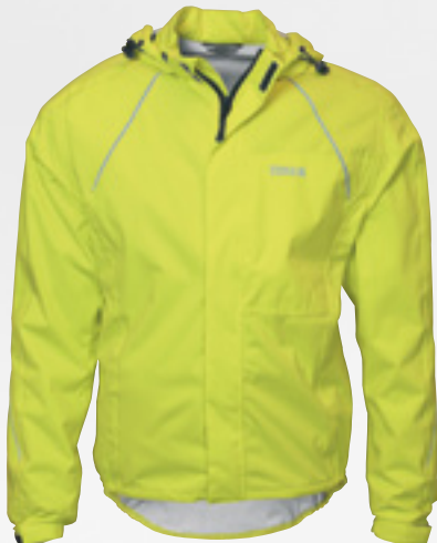
Neon Gelb 6450 - 0880