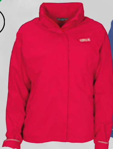
Mars Red 4895 - 0873