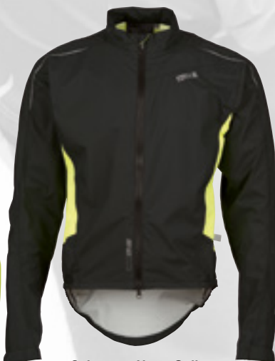
Schwarz - Neon Gelb 6880 - 0008