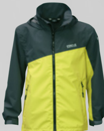
Anthrazit - Wild Lime