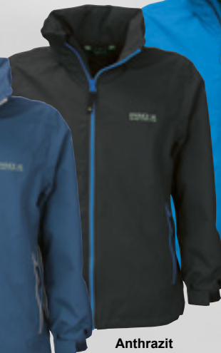
Anthrazit 9450 - 0922