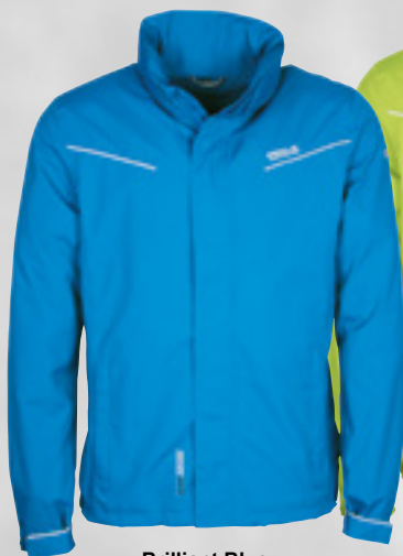
Brilliant Blue 7840 - 0773 (S.: S - 5XL)