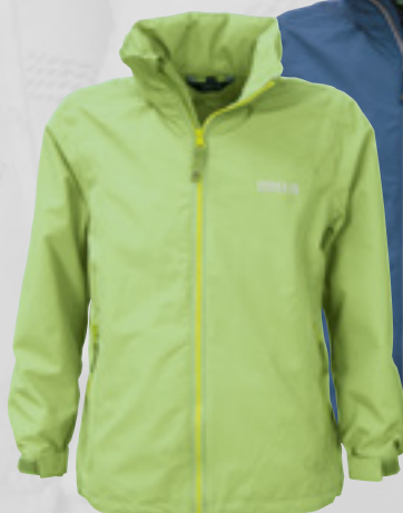
Meadow 9450 - 0932