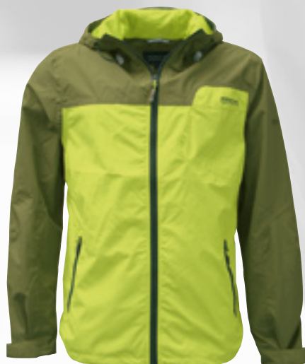
Moos - Wild Lime 4744 - 0814