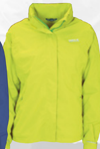
Neon Gelb 4895 - 0880