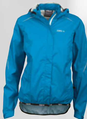
Pacific 6600 - 0780