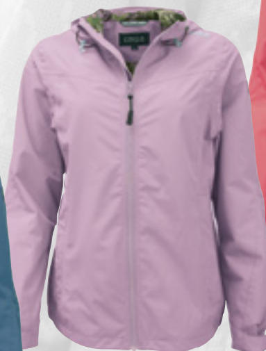
Orchidea 5735 - 0725