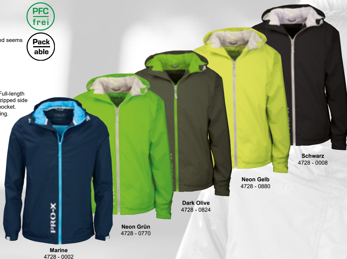
Marine 4728 - 0002