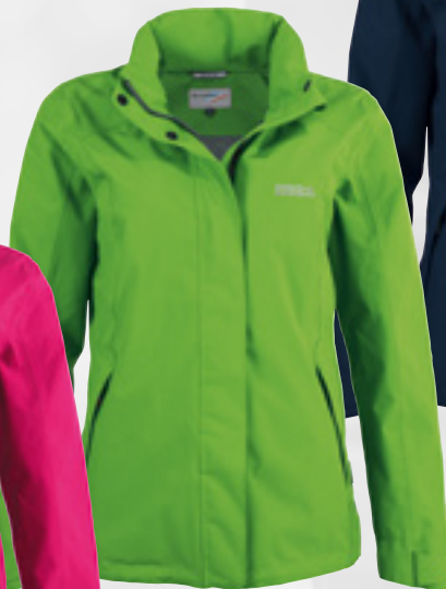
Kiwi 5225 - 0846