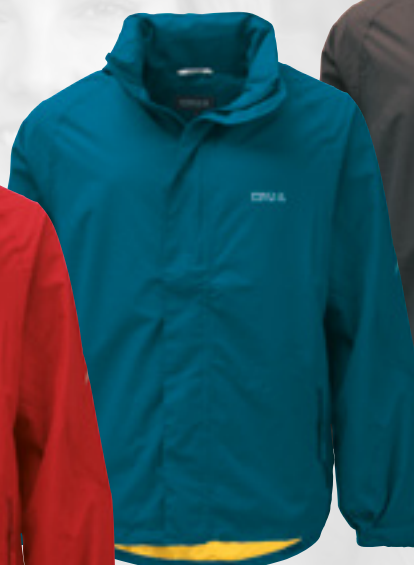
Blue Saphir 7520 - 0986