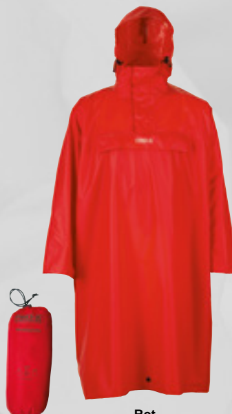
Rot 7285 - 0029