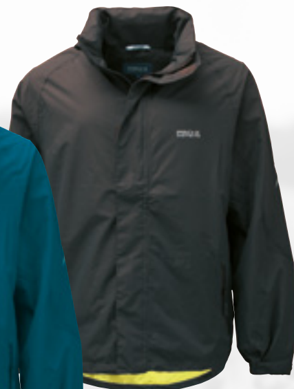
Anthrazit 7520 - 0922