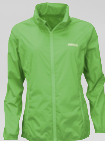
Bambus 7021 - 0971