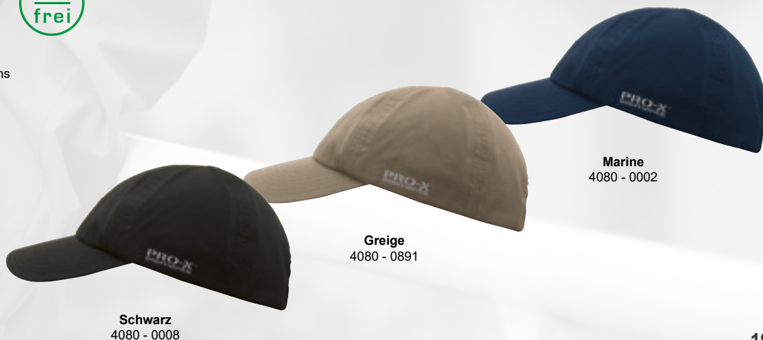
Greige 4080 - 0891