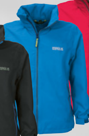
Brilliant Blue 9450 - 0773