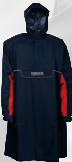
Marine - Rubinrot 3090 - 0002