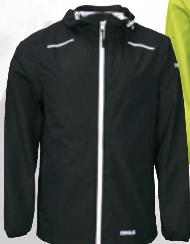
Schwarz 7770 - 0008