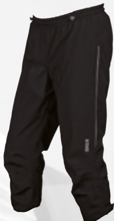
Schwarz 6652 - 0008