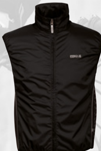
Schwarz 6170 - 0008