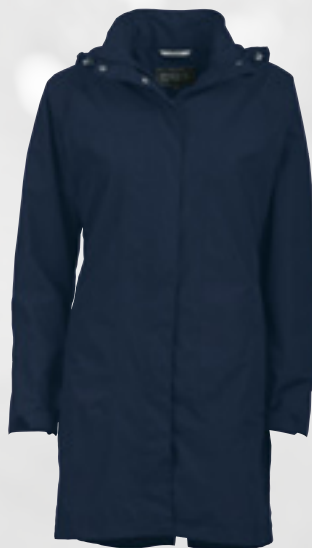
Marine 5651 - 0002