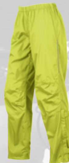
Neon Gelb 6710 - 0880