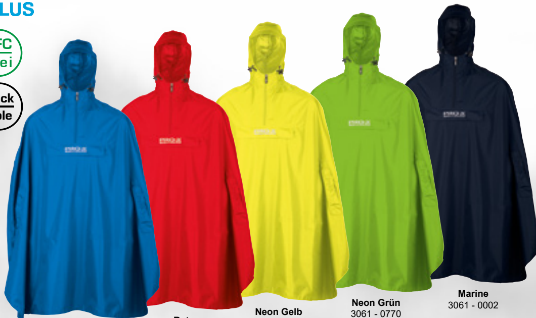
Royal 3061 - 0907