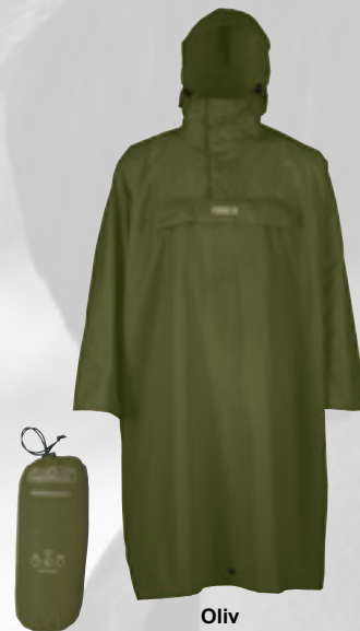
Oliv 7188 - 0967