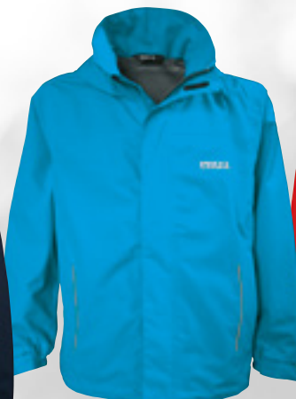
Methyl Blue 9920 - 0710