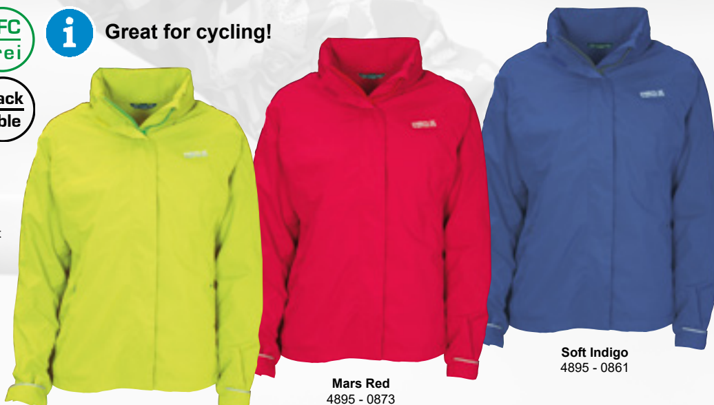
Neon Gelb 4895 - 0880