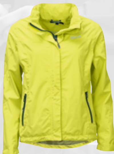
Wild Lime 7590 - 0962