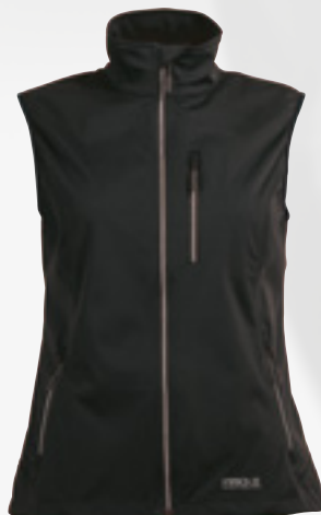
Schwarz 3722 - 0008