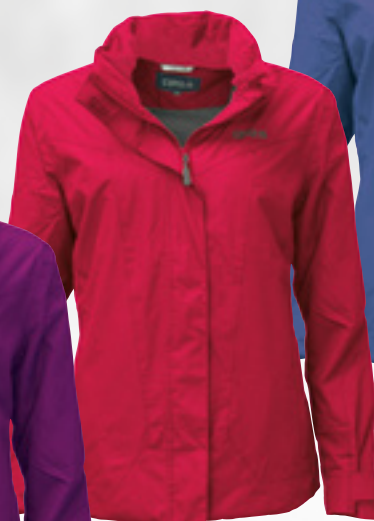
Salsa - Anthrazit 8812 - 0965