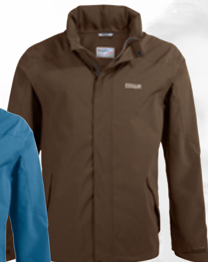
Braun 4225 - 0950