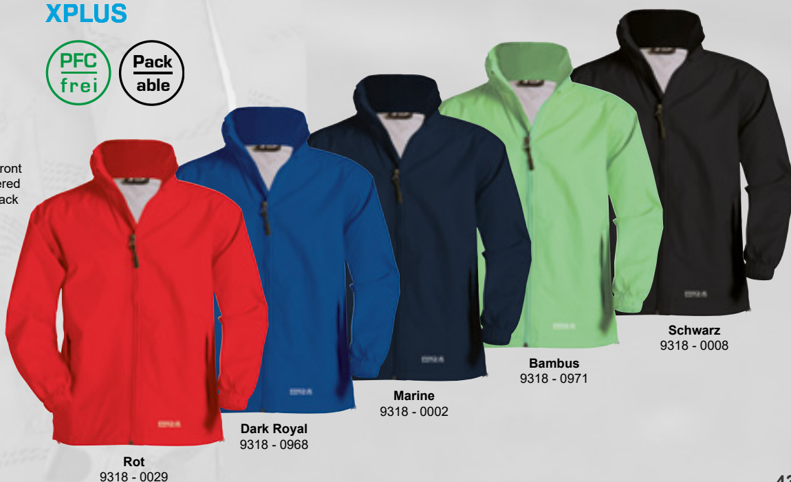
Rot 9318 - 0029