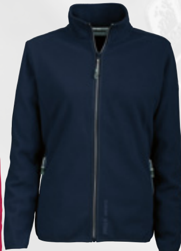
Marine 3665 - 0002