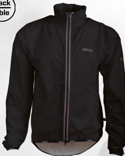
Schwarz 6500 - 0008