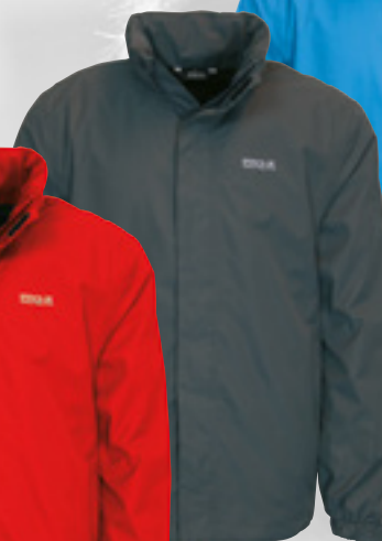
Anthrazit 4960 - 0922