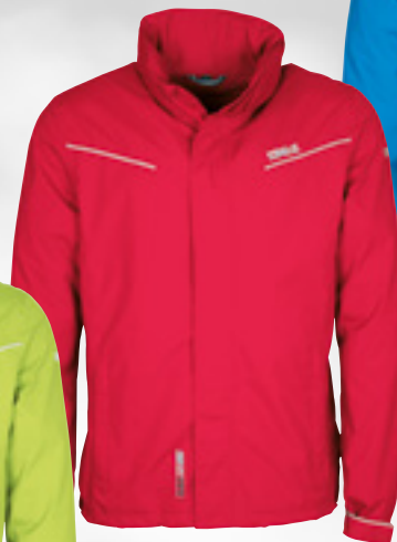
Mars Red 7840 - 0873