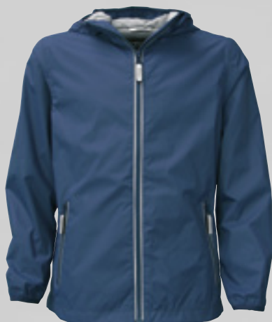
Vintage Indigo 9470 - 0953