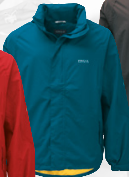
Blue Saphir 7520 - 0986