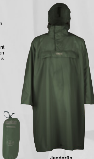
Jagdgrün 7285 - 0925