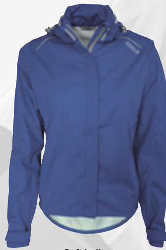
Soft Indigo 6650 - 0861