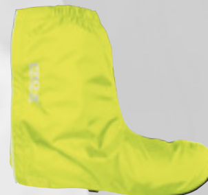
Neon Gelb 6118 - 0880