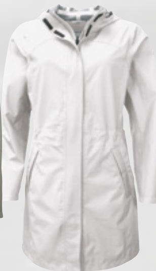
Weiss 8080 - 0001