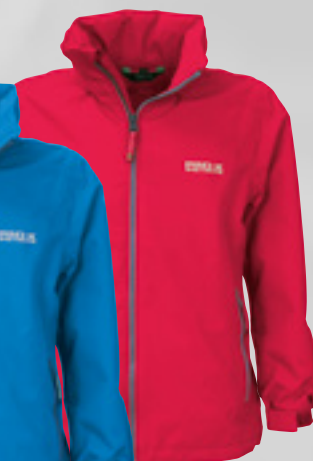
Mars Red 9450 - 0873