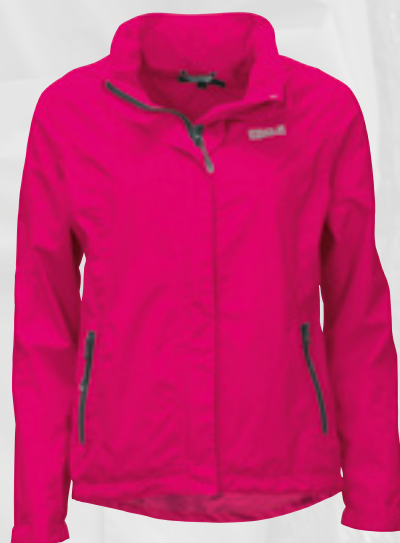
Cherry 7590 - 0833