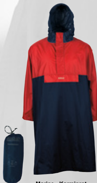
Marine - Karminrot 7184 - 0002