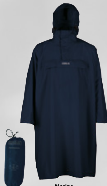
Marine 7285 - 0002