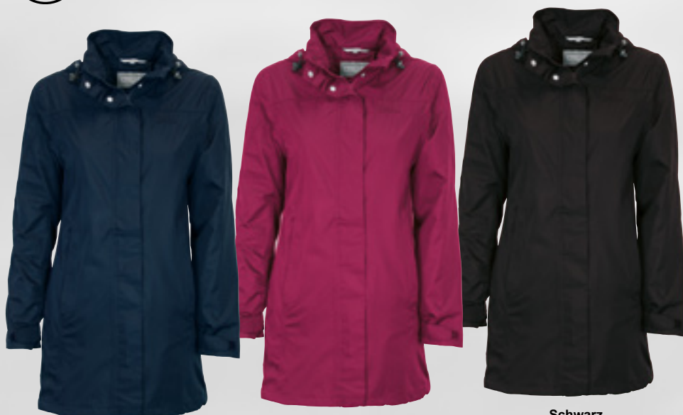
Marine 5180 - 0002