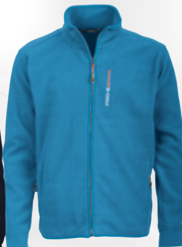
Seaport 2220 - 0702