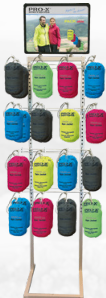
Bambus 0971 (S.: 36 - 48)