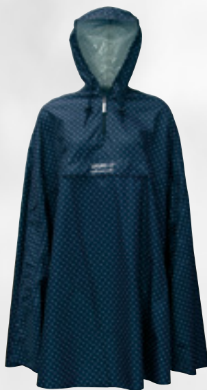
Marine 5061 - 0002