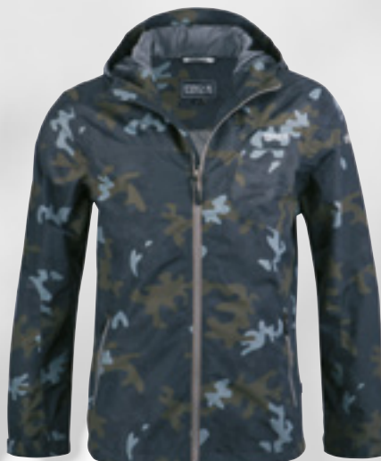
Anthrazit 4730 - 0922