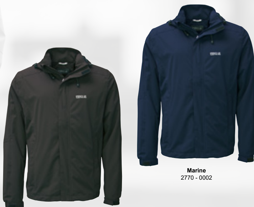
Marine 2770 - 0002