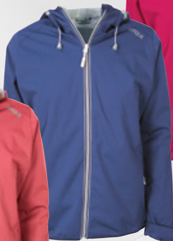
Soft Indigo 7650 - 0861