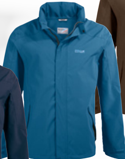
Seaport 4225 - 0702