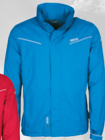
Brilliant Blue 7840 - 0773 (S.: S - 5XL)