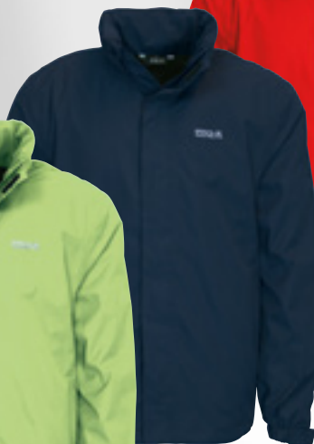
Marine 4960 - 0002