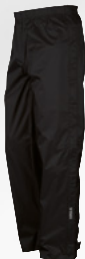
Schwarz 7455 - 0008