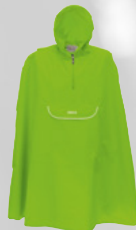
Neon Grün 9045 - 0770