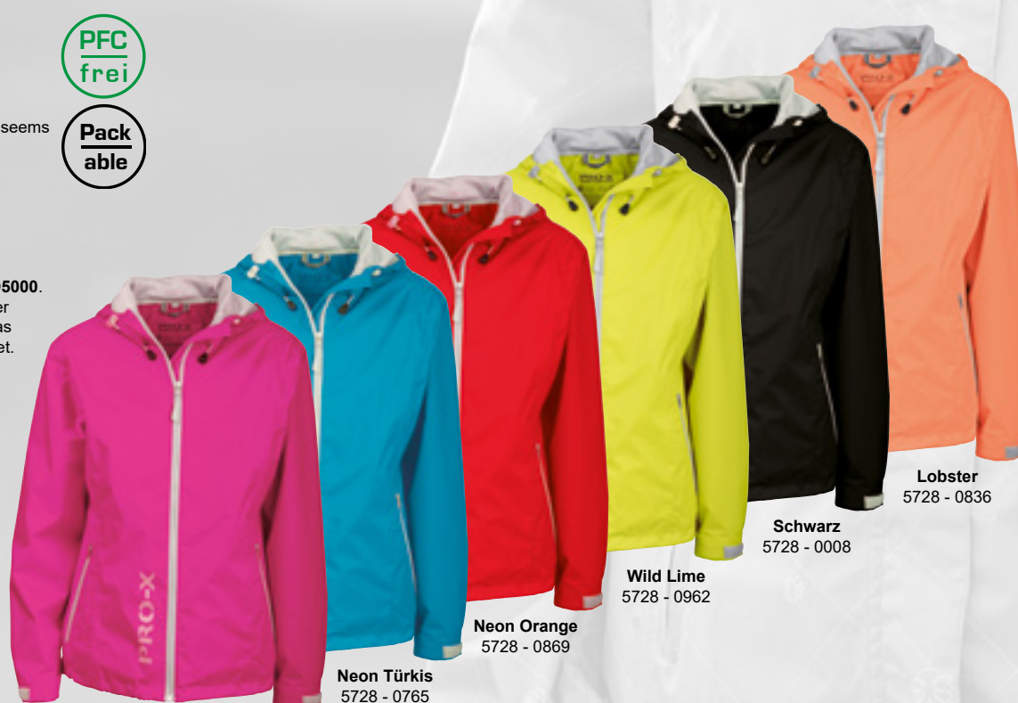
Neon Pink 5728 - 0767