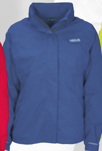
Soft Indigo 4895 - 0861