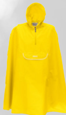
Gelb 9045 - 0906