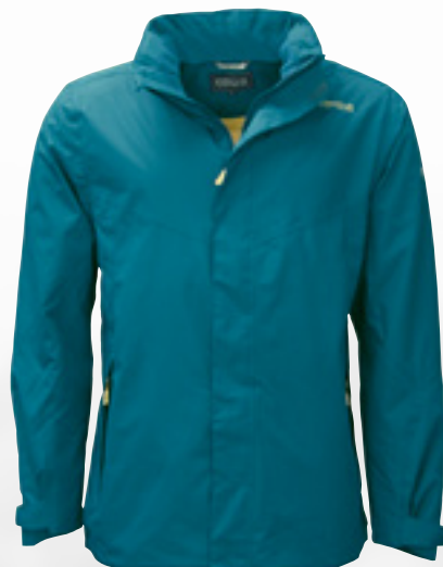
Blue Saphir - Solar 7812 - 0986