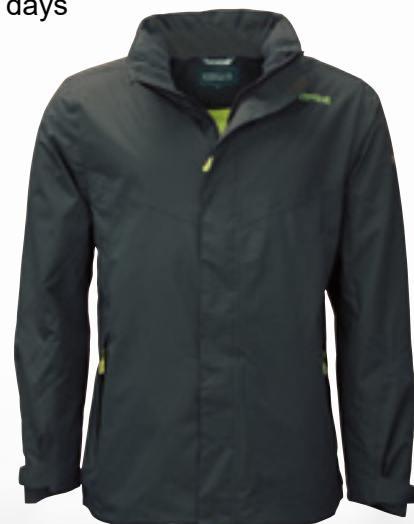
Anthrazit - Wild Lime 7812 - 0922