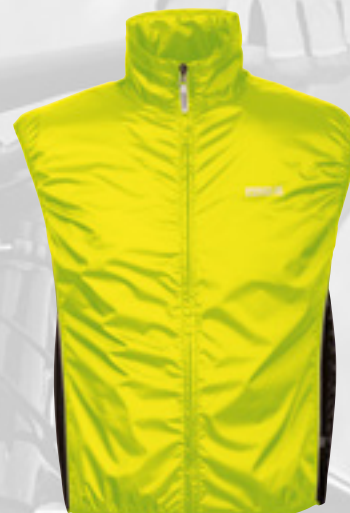
Neon Gelb 6170 - 0880