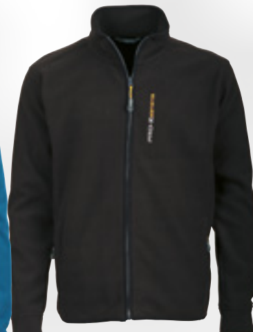
Schwarz 2220 - 0008