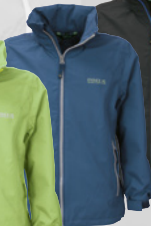
Vintage Indigo 9450 - 0953