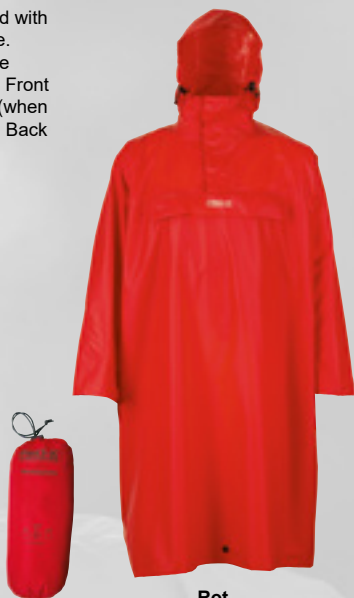
Rot 7183 - 0029