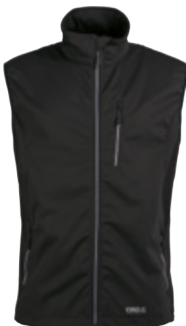
Schwarz 2722 - 0008