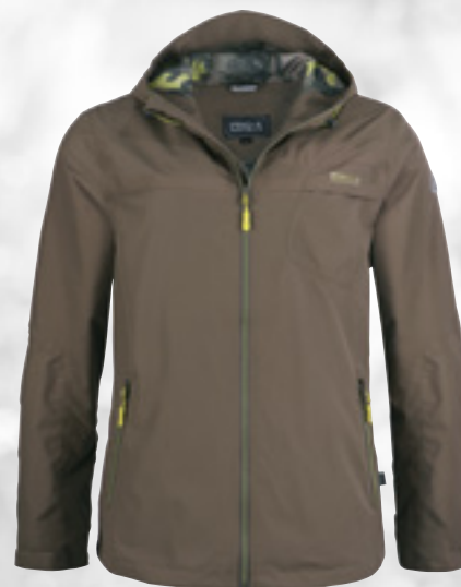
Dusty Leaf 4735 - 0999