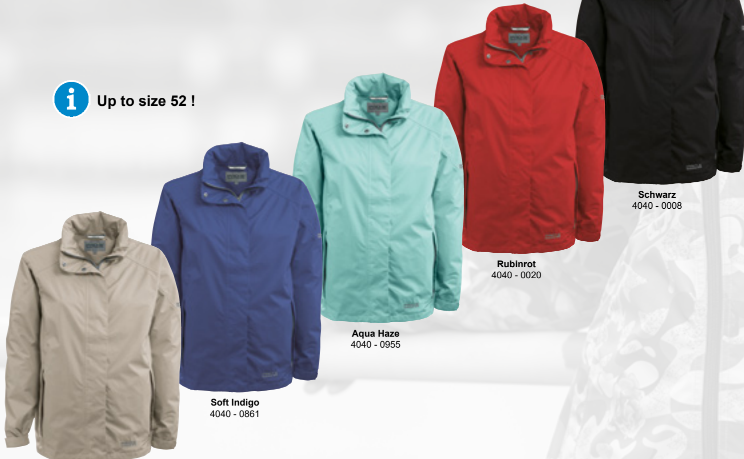
Schwarz 4040 - 0008