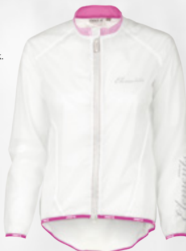
Transparent Pink 6635 - 0720