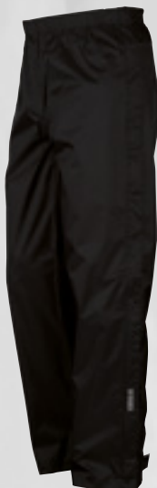
Schwarz 7417 - 0008