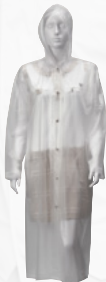
Transparent 3307 - 0933