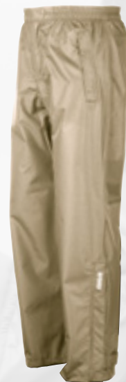
Greige 4079 - 0891 (only in S. 36 - 48 bzw. S - XXL)