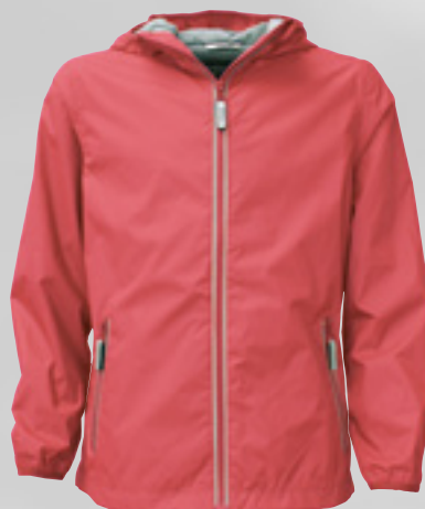
Campari 9470 - 0798