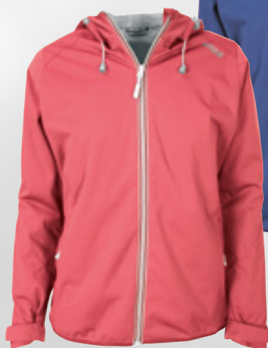
Teaberry 7650 - 0802