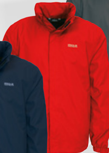
Lava 4960 - 0738