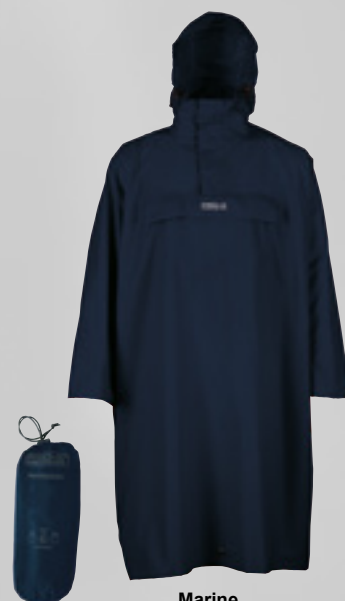
Marine 7183 - 0002