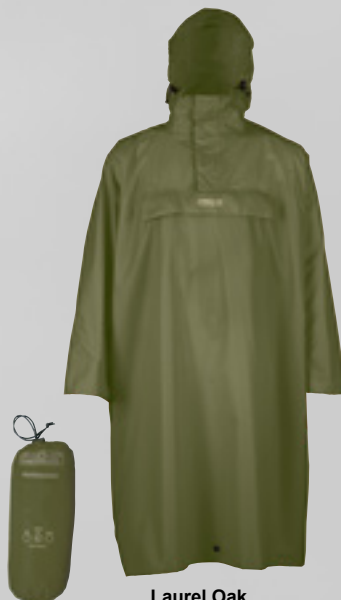
Laurel Oak 7183 - 0941