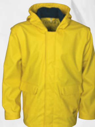
Gelb 9860 - 0906