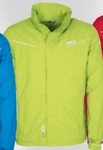
Neon Gelb 7840 - 0880