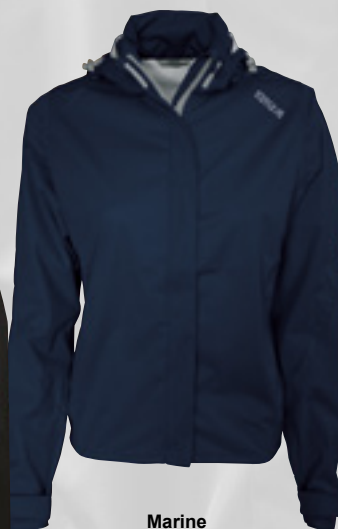
Marine 3770 - 0002