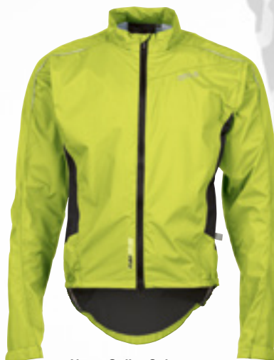
Neon Gelb - Schwarz 6880 - 0880