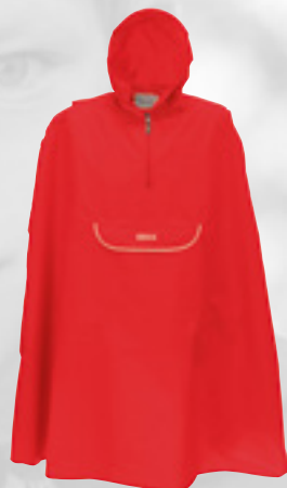
Rot 9045 - 0029