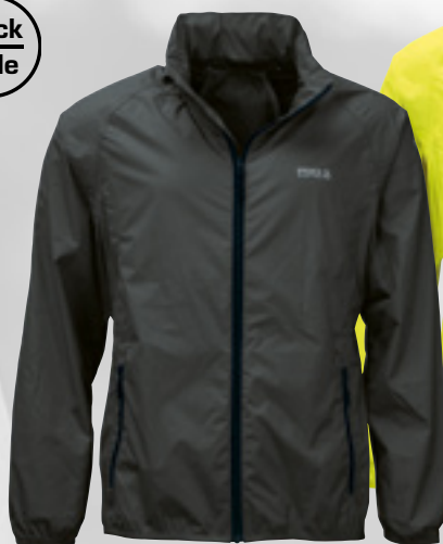
Anthrazit 7020 - 0922