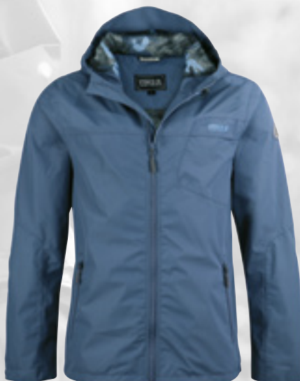
Vintage Indigo 4735 - 0953