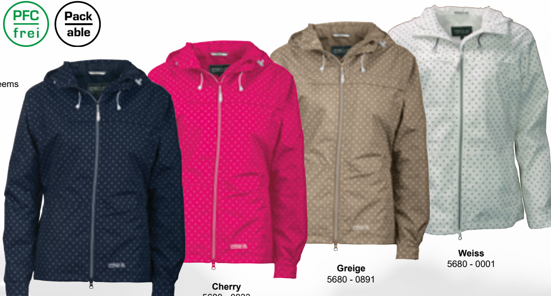
Marine 5680 - 0002