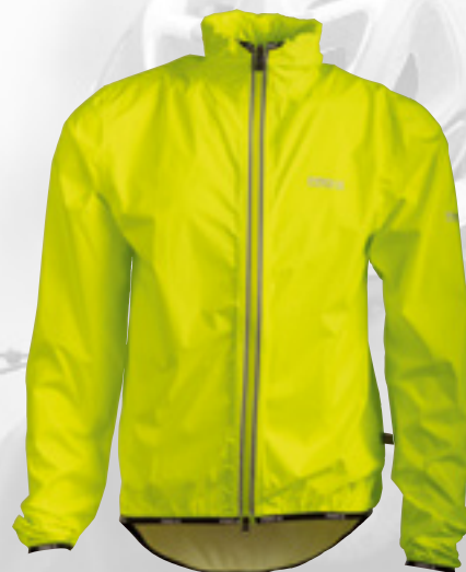
Neon Gelb 6500 - 0880