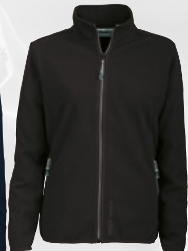
Schwarz 3665 - 0008