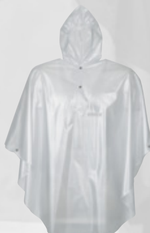
Transparent 9300 - 0933