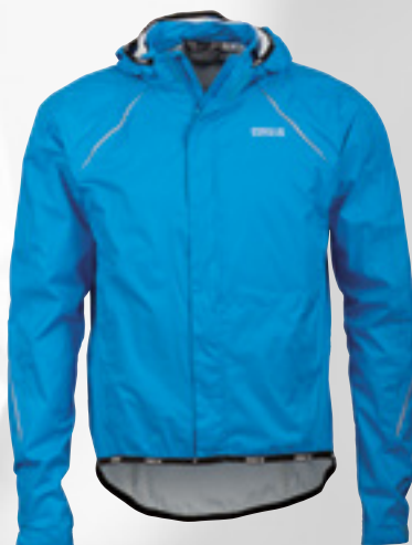
Malibu 6300 - 0857