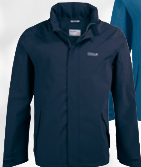
Marine 4225 - 0002