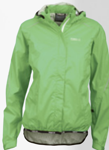
Bambus 6600 - 0971