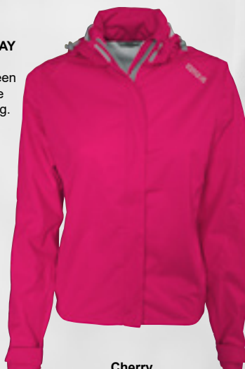
Cherry 3770 - 0833