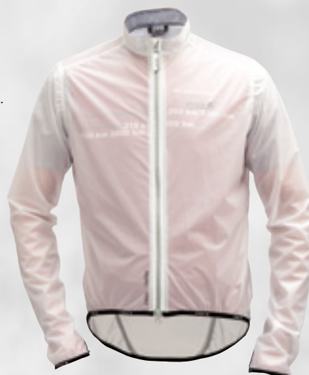
Transparent 6135 - 0933