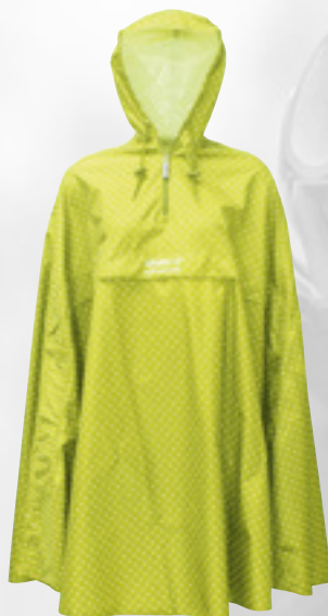
Wild Lime 5061 - 0962