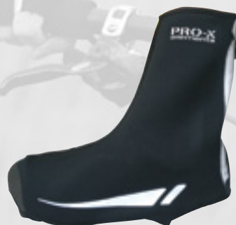
Schwarz 6121 - 0008