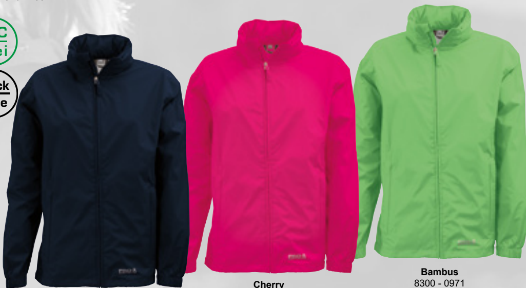
Marine 8300 - 0002