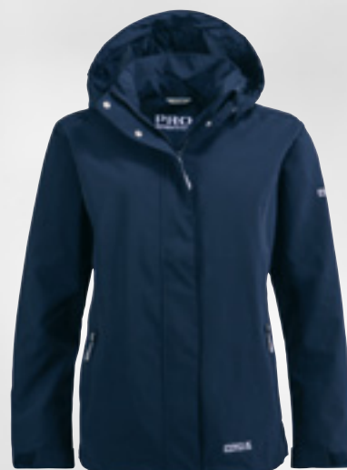
Marine 3477 - 0002