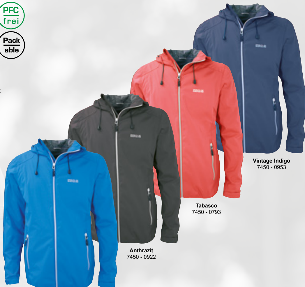
Vintage Indigo 7450 - 0953