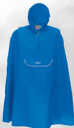
Royal 9045 - 0907