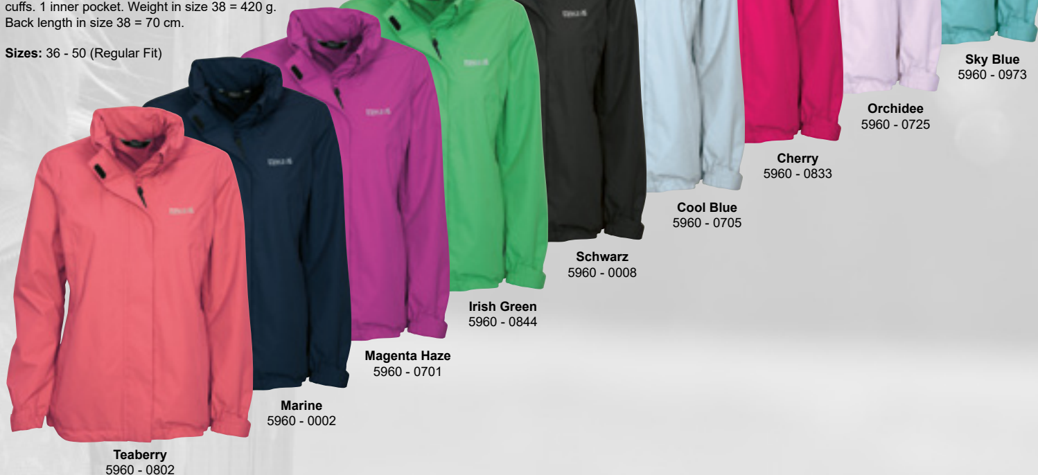
Sky Blue 5960 - 0973