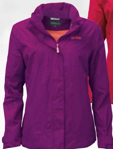
Aubergine - Emberglow 8812 - 0989