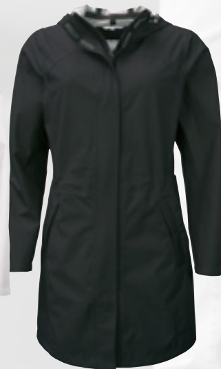
Schwarz 8080 - 0008