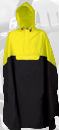
Neon Gelb - Charcoal 3065 - 0880