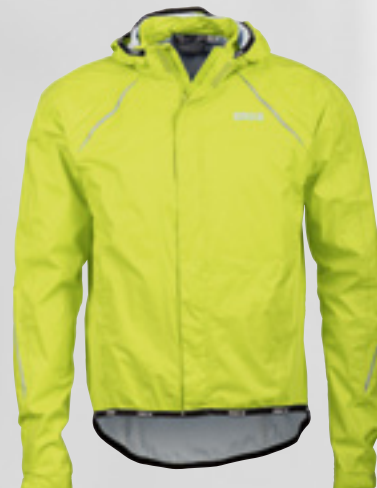
Neon Gelb 6300 - 0880