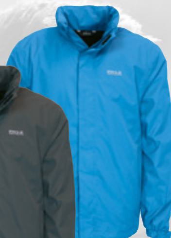
Brilliant Blue 4960 - 0773