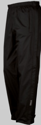
Schwarz 7722 - 0008