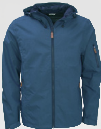
Vintage Indigo 7270 - 0953