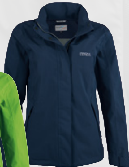
Marine 5225 - 0002