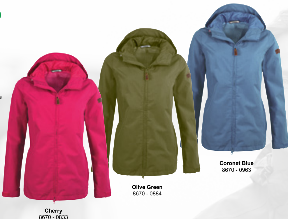
Cherry 8670 - 0833