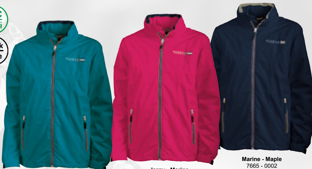
Blue Moon - Marine 7665 - 0716