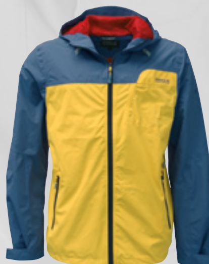
Coronet Blue - Solar 4744 - 0963