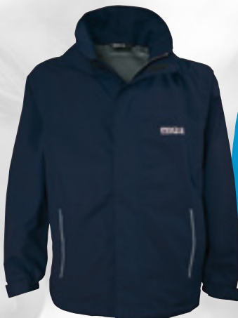
Marine 9920 - 0002