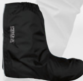
Schwarz 6118 - 0008