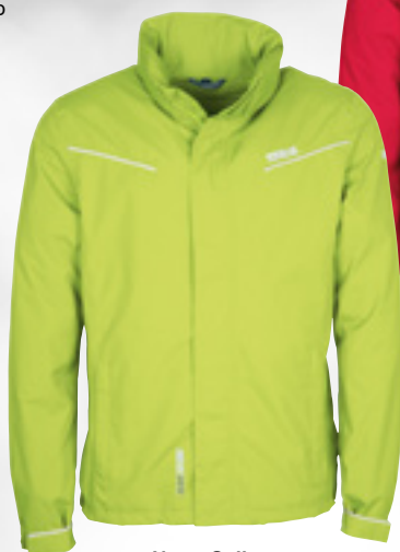
Neon Gelb 7840 - 0880