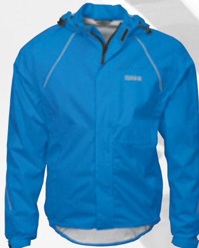
Brilliant Blue 6450 - 0773