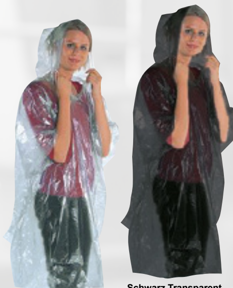
Transparent 3001 - 0933