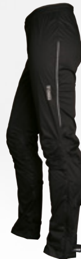
Schwarz 6655 - 0008