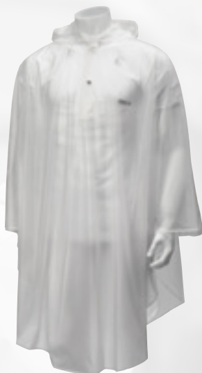
Transparent 3300 - 0933