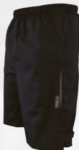
Schwarz 6744 - 0008