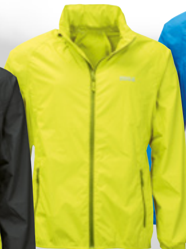
Neon Gelb 7020 - 0880