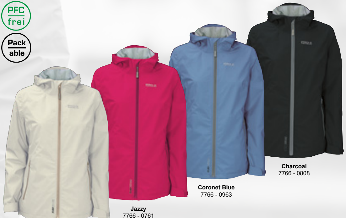
Rainy Day 7766 - 0711