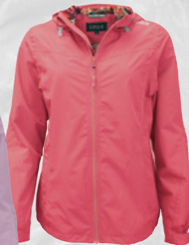
Teaberry 5735 - 0802