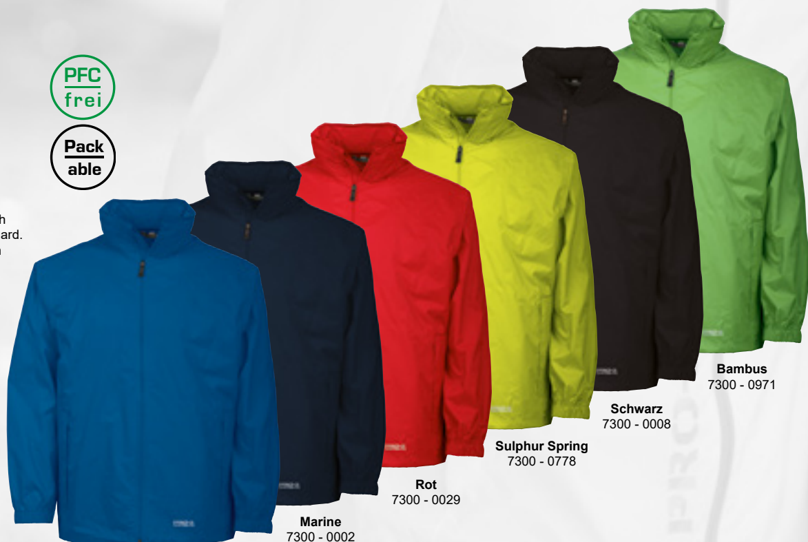
Dark Royal 7300 - 0968