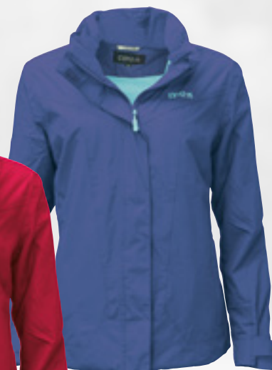
Soft Indigo - Sky Blue 8812 - 0861