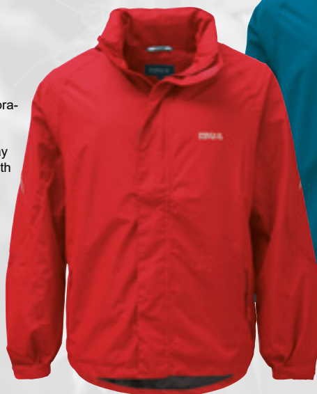
Rubinrot 7520 - 0020