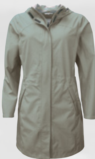
Foggy Grey 8080 - 0737