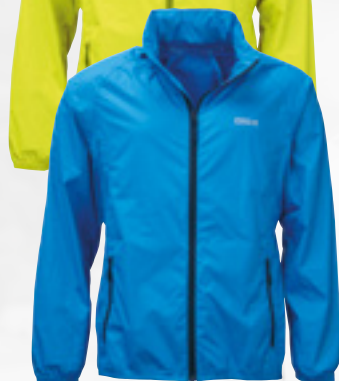
Brilliant Blue 0773 (S.: XS - 3XL)