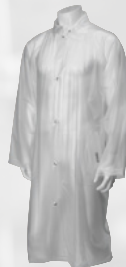
Transparent 3302 - 0933