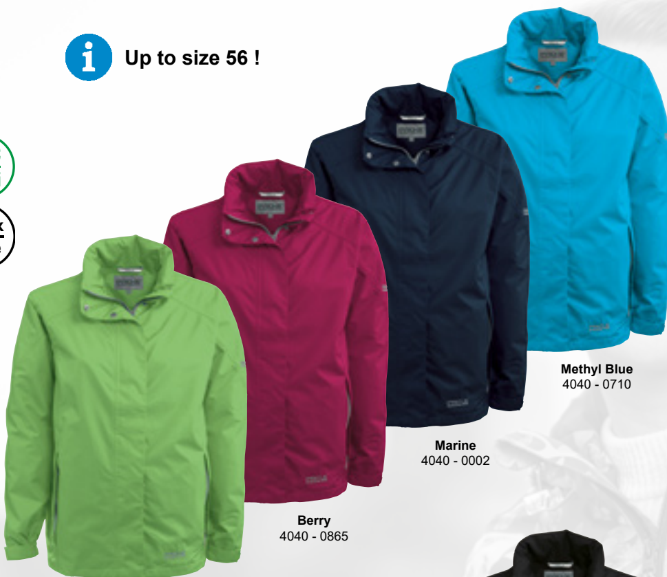
Methyl Blue 4040 - 0710