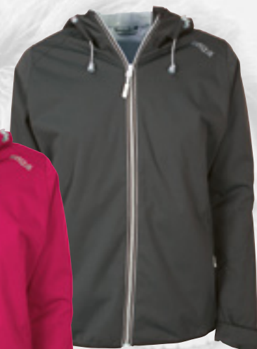
Anthrazit 7650 - 0922