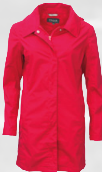
Mars Red 8835 - 0873