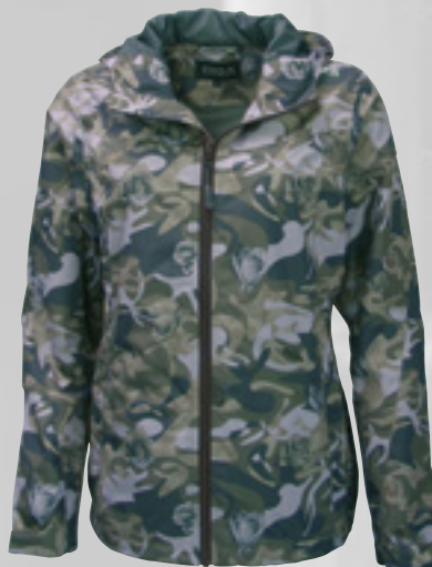
Dusty Leaf 5730 - 0999