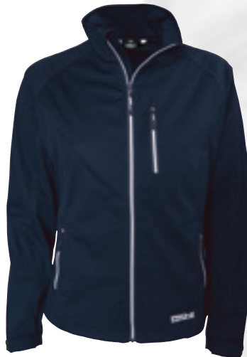
Marine 3720 - 0002