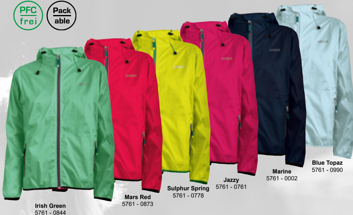
Irish Green 5761 - 0844