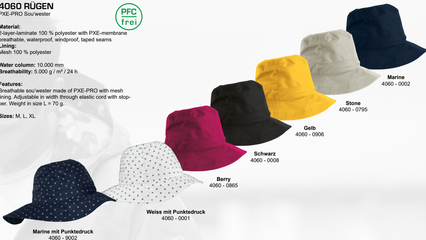
Marine 4060 - 0002