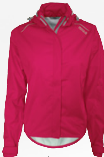
Jazzy 6650 - 0761