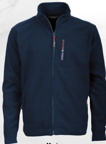
Marine 2220 - 0002