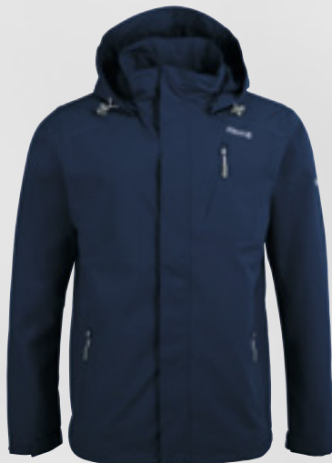
Marine 2470 - 0002