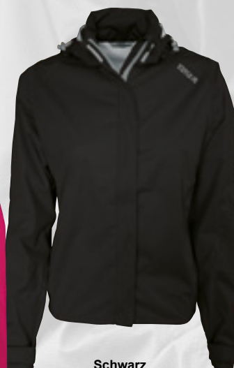
Schwarz 3770 - 0008