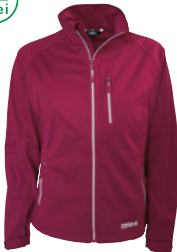
Berry 3720 - 0865