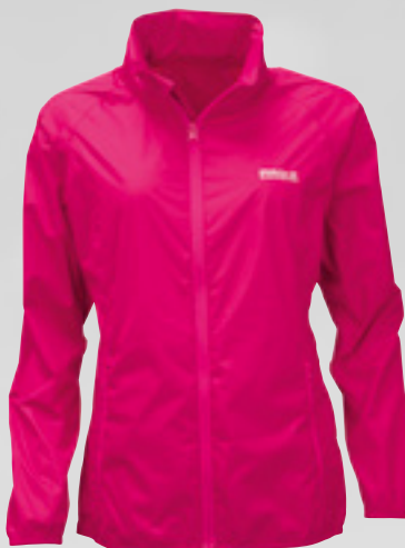
Cherry 7021 - 0833