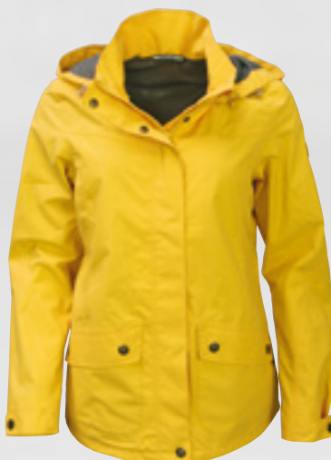
Mais 8270 - 0860