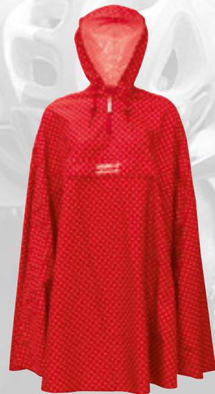
Rot 5061 - 0029