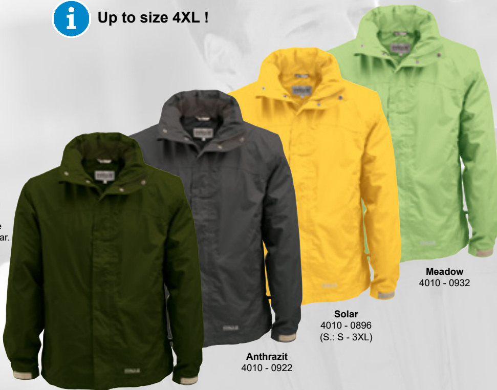
Meadow 4010 - 0932