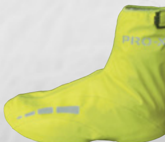
Neon Gelb 6123 - 0880