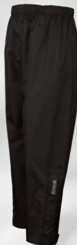
Schwarz 9079 - 0008