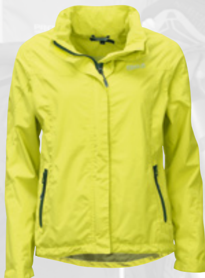
Wild Lime 7590 - 0962