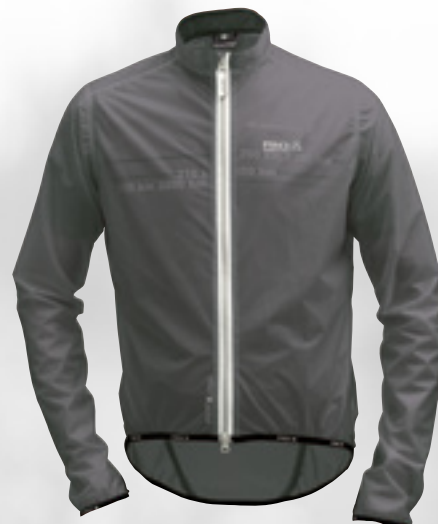
Anthrazit 6135 - 0922