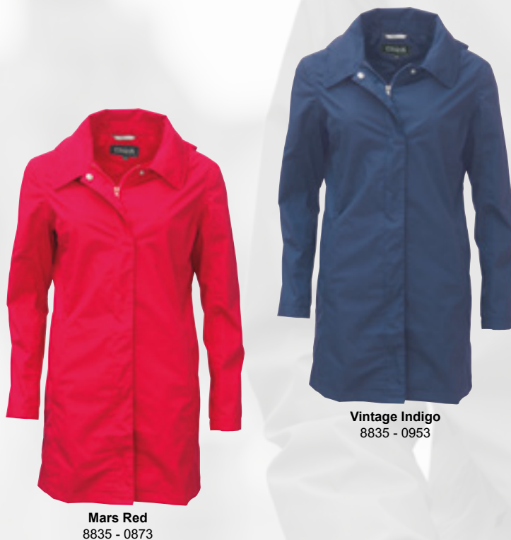
Mars Red 8835 - 0873