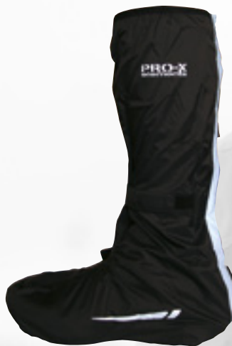
Schwarz 6117 - 0008