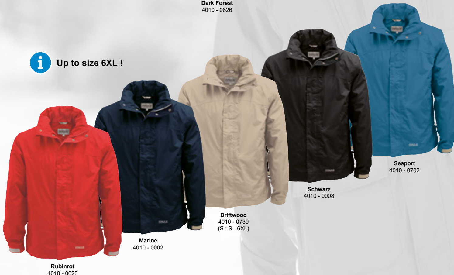
Seaport 4010 - 0702