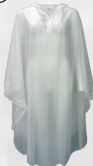
Transparent 3660 - 0933