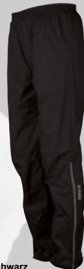
Schwarz 7607 - 0008