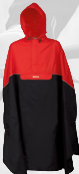
Rot - Charcoal 3065 - 0029