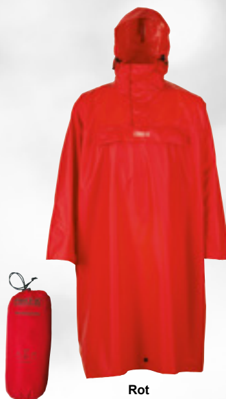
Rot 7188 - 0029