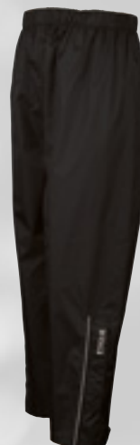
Schwarz 9189 - 0008