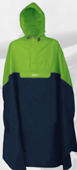
Neon Grün - Marine 3065 - 0770