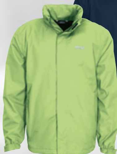
Meadow 4960 - 0932